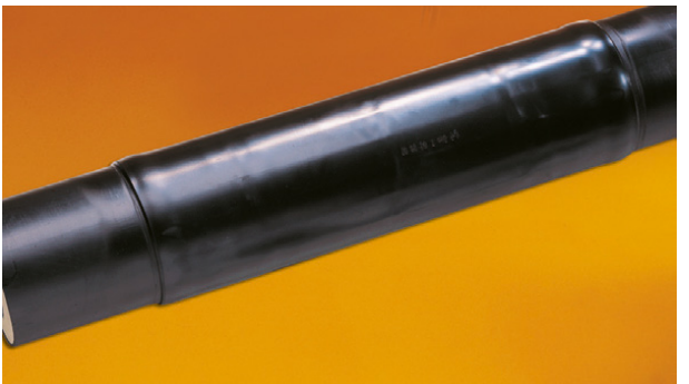
Correctly installed – the expansion marks have disappeared