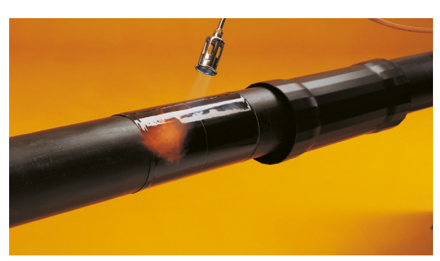
Heating the shrink film. First seal