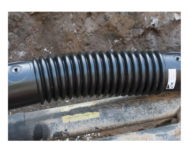
SXB-WP in the field

The SXB-WPJoint is the obvious choice when you encounter odd angles in the course of a project. However, it may also be advantageous to use the SXB-WPJoint for standard 90-degree bends. One SXB-WPJoint replaces a pre-insulated bend and two straight joints. This provides simpler logistics and project planning, thus ultimately reducing the total costs by 10-15%. Only one joint with the SXB-WPJoint system.