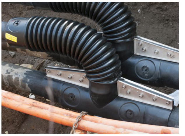
SXT-WPJoint in the field